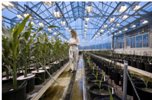
The next generation in the greenhouse

True, for the past 13 years Monsanto has been licensing its technology broadly, to hundreds of firms, including some of its main competitors. This, the paper concedes, has ensured that Monsanto has not ended up in "control of large, totally closed platforms in transgenic seed that could be challenged only by the unlikely emergence of rival platforms." However, it cites Monsanto's reputation for defending its intellectual property fiercely through the courts as another reason why the antitrust authorities should take a look at the firm.